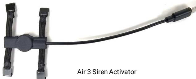
Air 3 Siren Activator