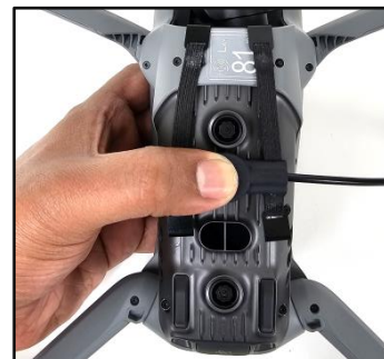
By using the other hand, hook the hooks to the top side of the Drone as shown in the image