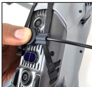
Once the top hooks are hooked to the position, pull the bottom hooks and hook them to the third ventilation pocket on both the left and right side of the Drone, as shown in the image