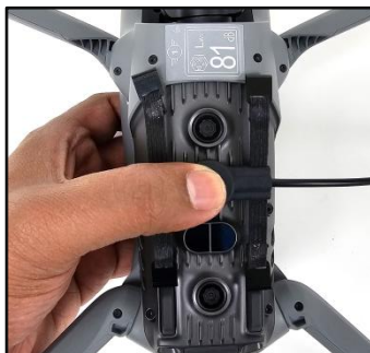
Align the Activator to the drone's bottom light and hold it with one hand in its place as shown in the image