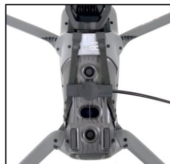
Once the hooks are placed in the position, the Activator will be ready to use