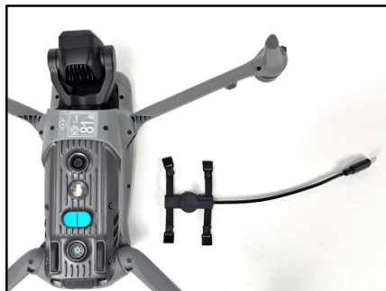
Place the drone upside down