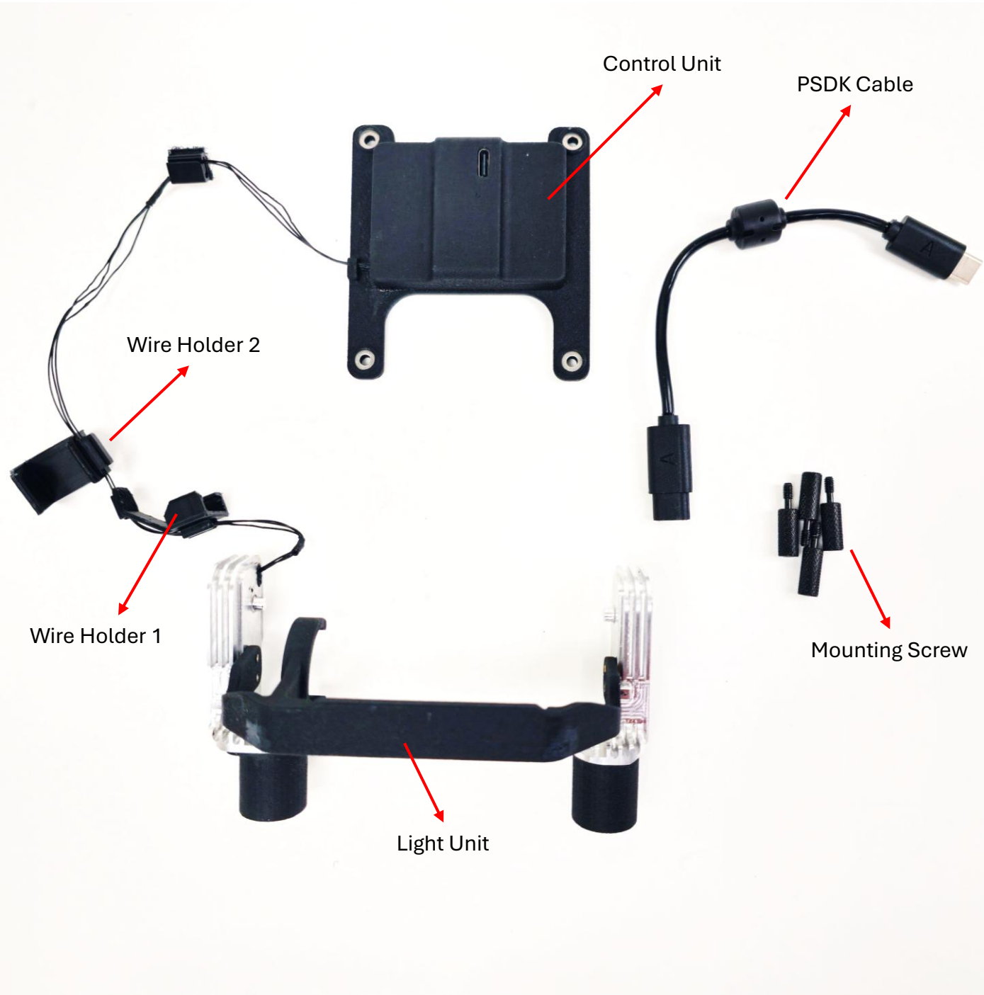
Parts included in BOX